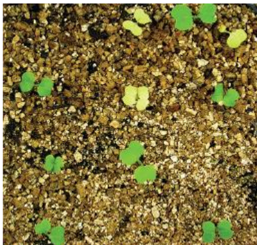
Figure 2: The recessive FPsc albino mutant allele prevents elaboration of the photosynthetic machinery (yellow segregants among the F2s shown above) if present in homozygous condition.

4. Dominant versus recessive alleles: Now let us turn to another bugaboo of genetics vocabulary- the relationship between dominant and recessive alleles. Many students have a rather superficial, rule-based understanding of the distinction between dominant and recessive alleles: Dominant alleles are those whose effect on phenotype is evident when present in a single copy; conversely, recessive alleles must be present in homozygous condition in order to produce a detectable change in organismal phenotype as compared to that of the (phenotypically) wild type individual. Those rules certainly apply, but fail to convey any sense of the molecular basis for why those rules exist in the first place. To lay the groundwork for the analogy that follows, recognize that mutant alleles arising spontaneously through errors in DNA replication or damage repair processes, or mutant alleles that result from chemical mutagenesis of the reference wt genome typically yield what geneticists refer to as “loss of function”