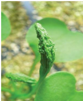
Figure 3: The dominant FPSC ale mutant allele causes pronounced leaf curling.

On the other hand, dominant alleles often result from “gain of function” mutations whose effects are evident even if present in just a single copy. As a hypothetical example, imagine a mutation that alters the substrate specificity of a key metabolic enzyme such that the encoded gene product enables the organism to harvest energy from an additional carbohydrate source in its environment—for example, let’s say an organism carrying the mutant allele, expressed in precisely the same tissues and at the same level of expression as its wt counterpart can digest both glucose and sucrose, while those individuals carrying only the wild type allele must live on glucose alone. If sucrose is plentiful in the environment and carbon sources are growth-rate limiting, the heterozygote will likely enjoy a fitness advantage over the wild type homozygote.