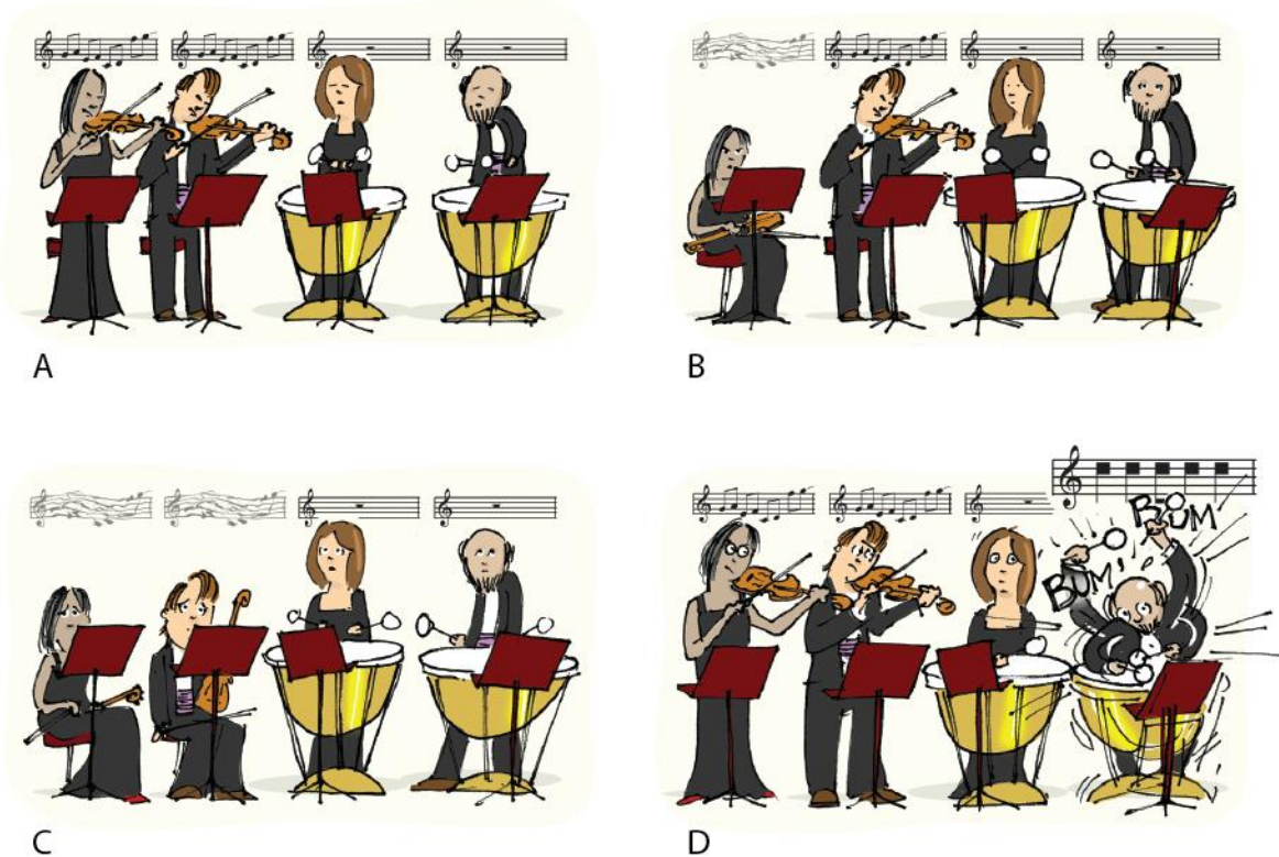
Figure 4: Musical Mutations. A) With all sheet music printed correctly the violins play while the tympani rest. B) Garbled sheet music prevents one violin from performing, however the second violin can perform and the piece proceeds. This represents a heterozygous genotype in which the functional (wildtype) allele is dominant over a recessive, loss-of-function allele. C) If the sheet music for both violins is garbled, the piece cannot be performed. This represents a homozygous recessive genotype. D) The sheet music for the violins is correct, however, one tympani score is garbled prompting the tympanist to play when he should rest. Even though one tympani has the correct (wildtype) score a single mutant copy of the score is sufficient to disrupt the performance. This is analogous to a dominant, gain-of-function mutation.

What if the sheet music for one of those violinists had been garbled to the point of uselessness during the printing process, an error that had gone unnoticed until the evening of the performance? Unable to perform, the violinist with unreadable sheet music would effectively be silenced, but the violinist with the proper sheet music could continue nonetheless, playing a bit louder if necessary to achieve the desired and dramatic effect; the “phenotype” of the movement would likely be little changed (Figure 4, panel B). However, if both violinists’ sheets were similarly garbled and neither had memorized the passage, nearly all is lost: the musical piece fails to reach its emotional crescendo and the phenotype has changed decidedly for the worst (Figure 4, panel C).